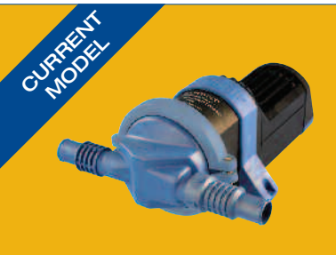
AK2050 Pump head assembly

BP2052(B) (12V d.c. version), BP2054(B) (24V d.c. version)